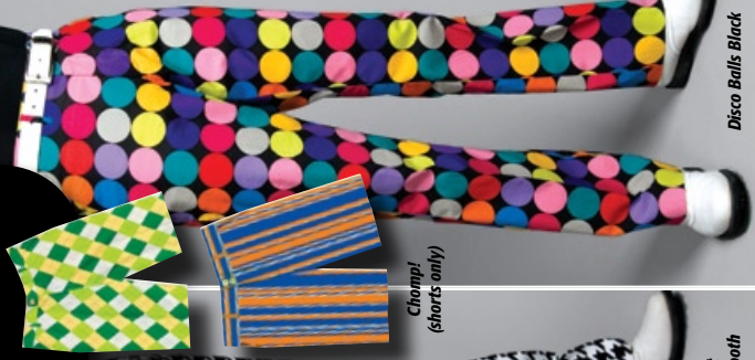
Disco Balls Black