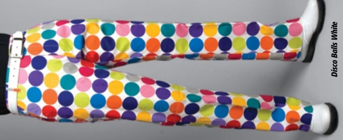
Disco Balls White