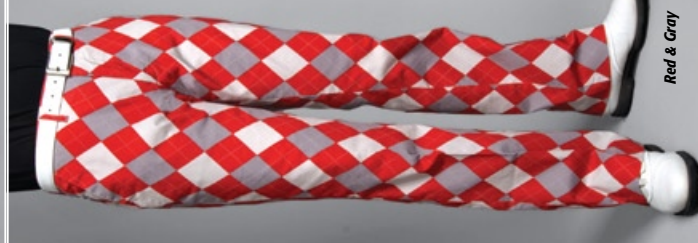
Red & Gray