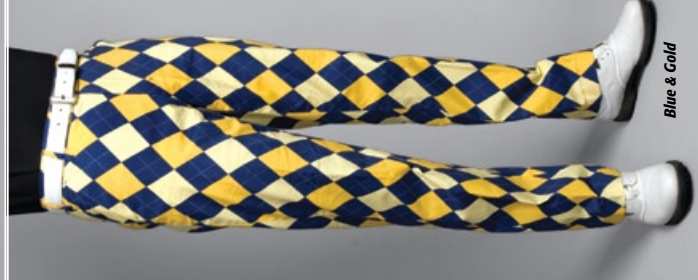
Blue & Gold